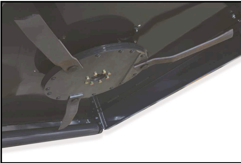
Three-blade cutting system mounted to a large circular flywheel.

Specifications and designs are subject to change without notice.