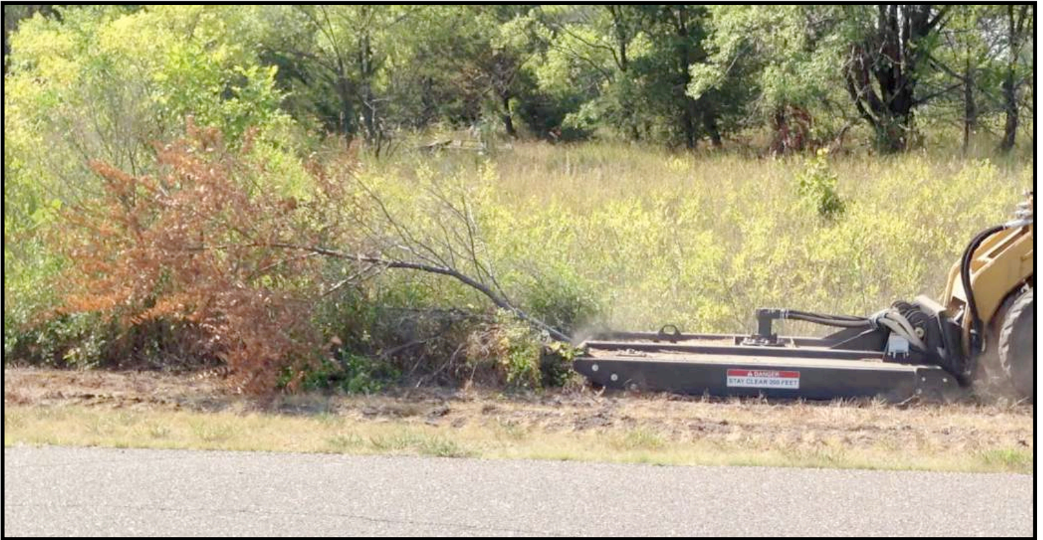
Push over and cut through brush with ease.