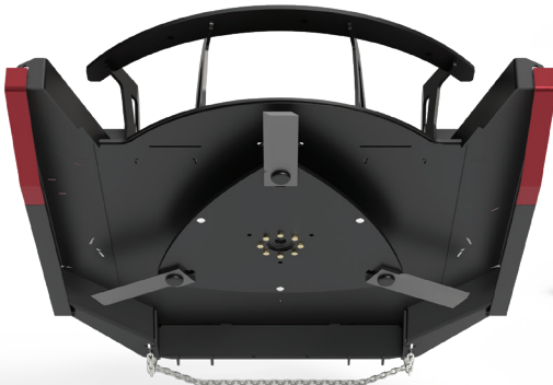
DETAIL UNDER DECK