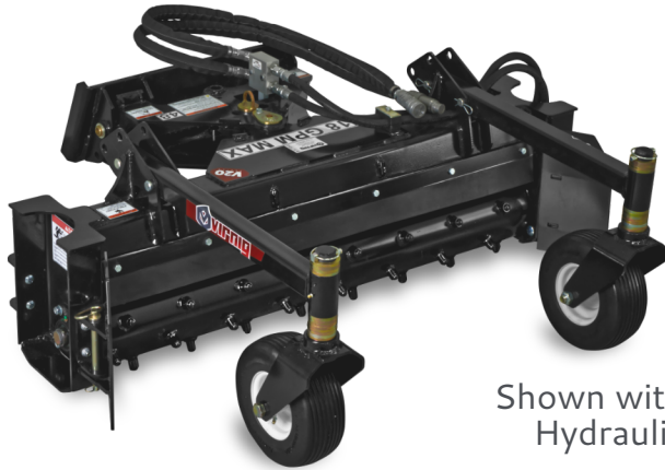
Shown with optional Hydraulic Angle

Grade soil and gravel, prepare seedbeds and remove debris.