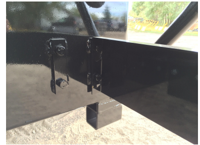
Removable Sidewalk Guard