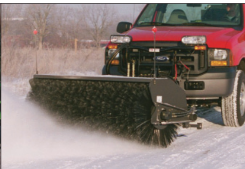
Truck Mounted LA Sweeper