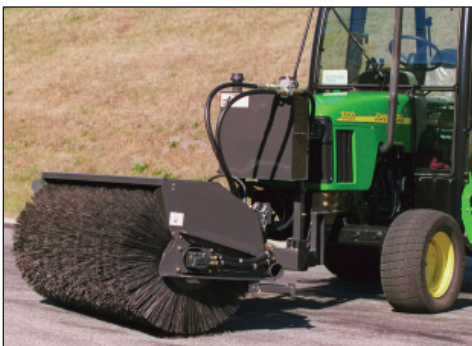
Tractor Mounted AH/CH Sweeper

Sweepster manufacturers a complete line of sweepers. Visit our website www.paladinbrands.com to see the complete line!