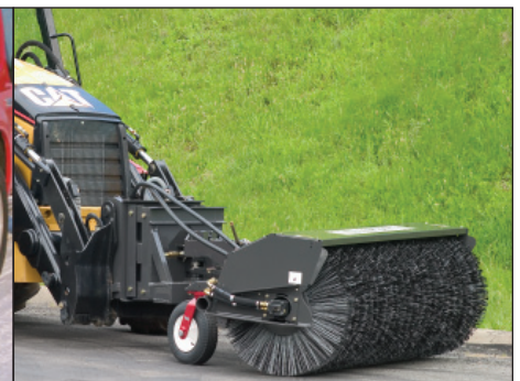
Loader Mounted LA Sweeper