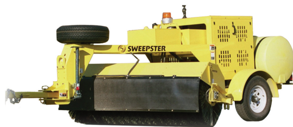
TBCP shown with optional spare tire, engine shroud, water system, drape deflector, strobe light, fenders & swing hitch.