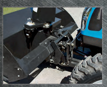
The Erskine quick attach mounting system allows for easy attachment and removal of blower unit