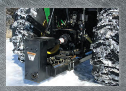
The efficient transfer case transfers power from the rear PTO to the front mounted snowblower.

We offer several different widths from 60" to 108", all of which are true quick attach systems that allow easy on/off attachment in approximately 5 minutes. Standard features include hydraulic lift and chute rotation, bolt-on cutting edge, and adjustable skid shoes. These ruggedly built Erskine snowblowers are second to none in features, performance, and durability.