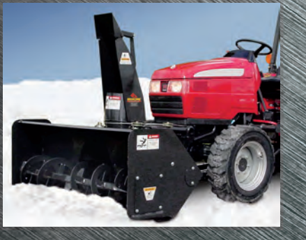
Fits all tractors with or without front loader mounting bracket